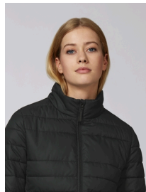
Stella Walks Long Sleeve