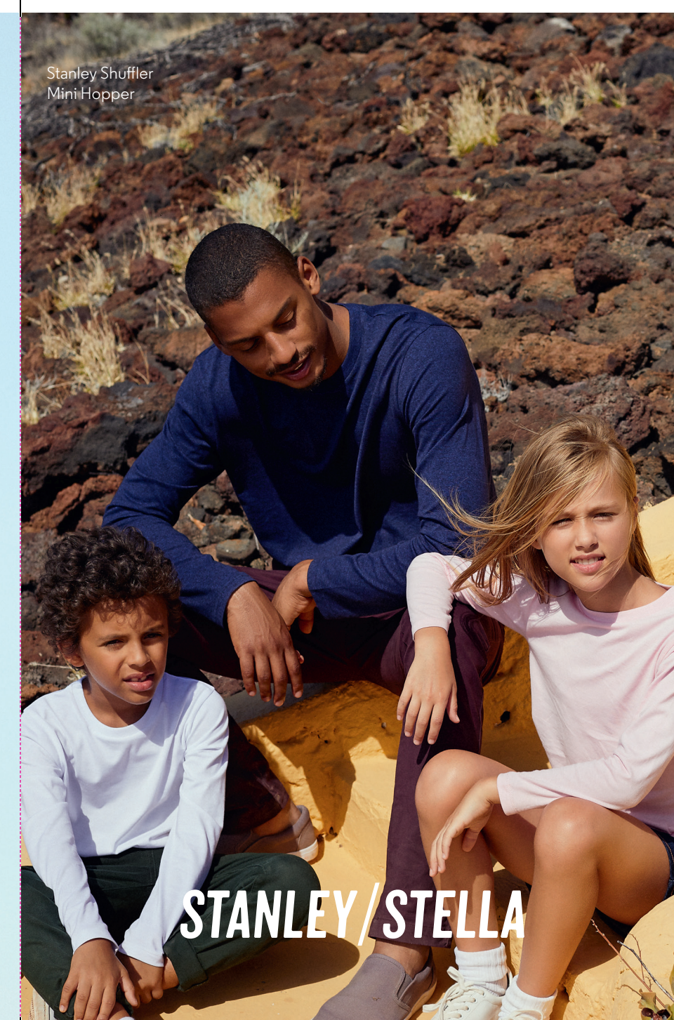
Stanley Shuffler Mini Hopper